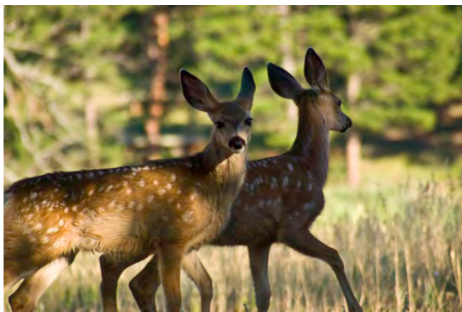
DMC is home to dozens of species of wildlife including mule deer.