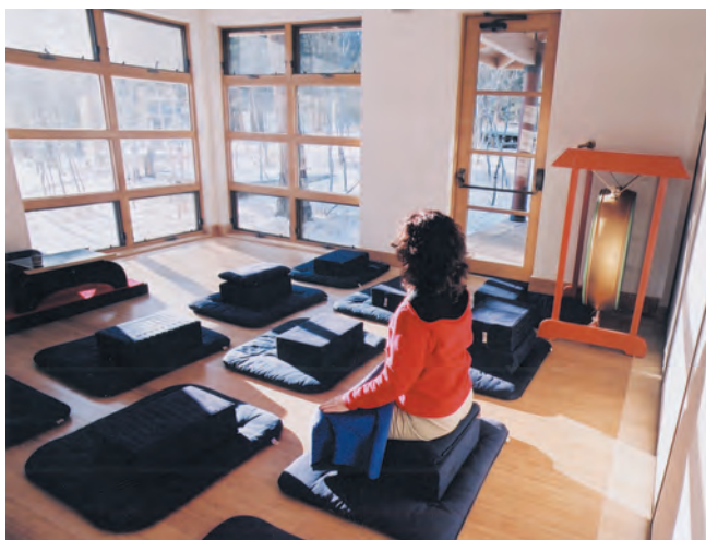
DMC's many shrine rooms and program spaces accommodate meditation and yoga retreats, as well as conferences.