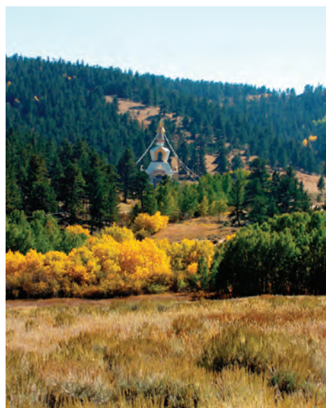
View of the Stupa in autumn.