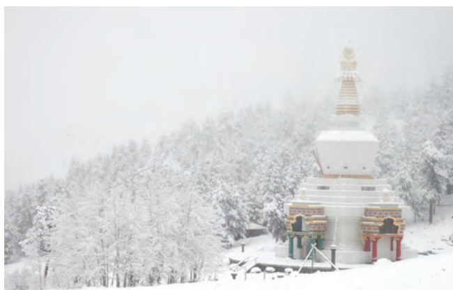
The Stupa after a winter snowfall.