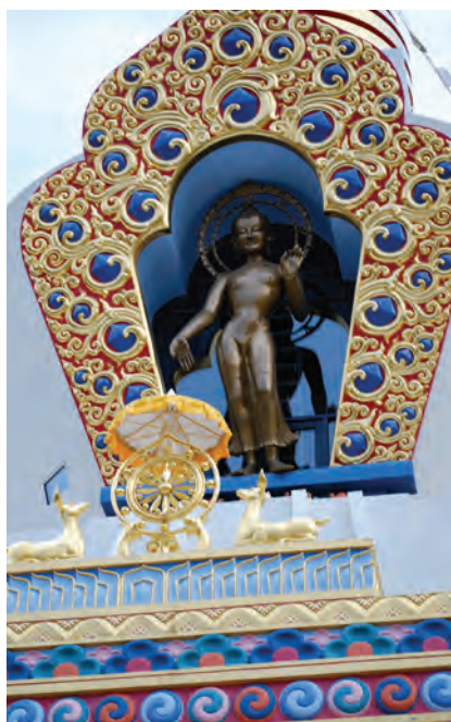
A standing Buddha in the structure's portal.