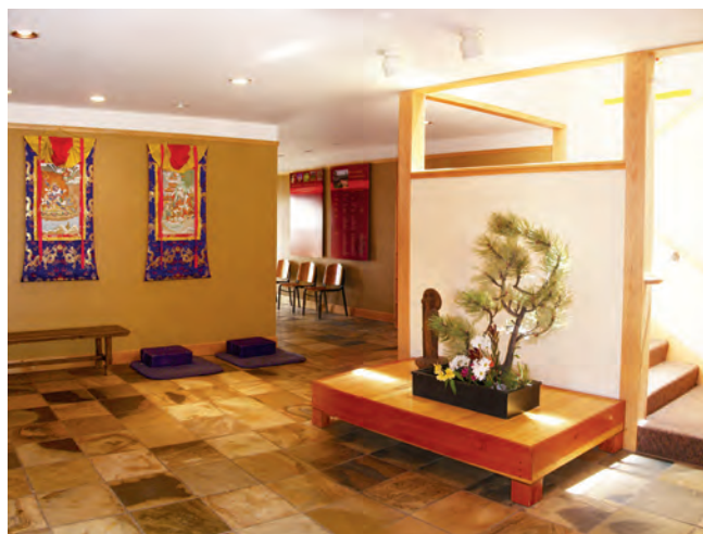
An Ikebana flower arrangement in the lobby of our Sacred Studies Hall.