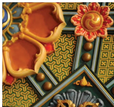
Much of the Stupa's ornamentation is hand-carved, including these indoor pillars.