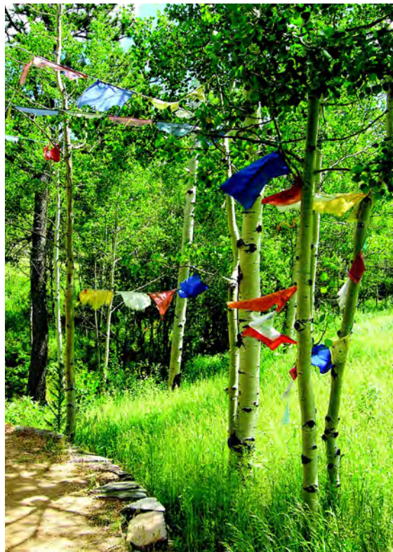
A spring view of the scenic trail leading to the Great Stupa