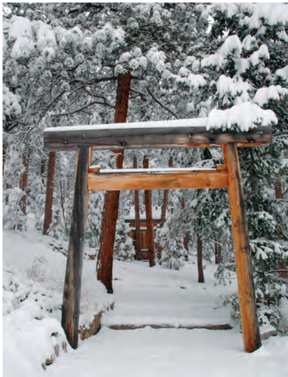
One of the Shinto-style gates leading to the Kami Shrine.