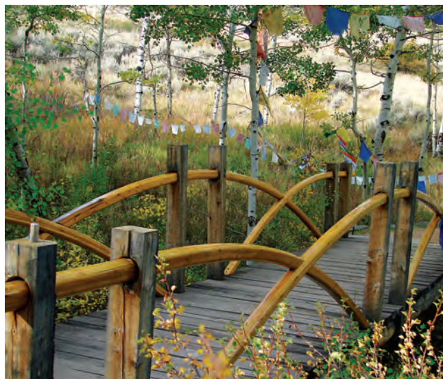
The Stupa trail in autumn, with Tibetan prayer flags strung from the aspen.