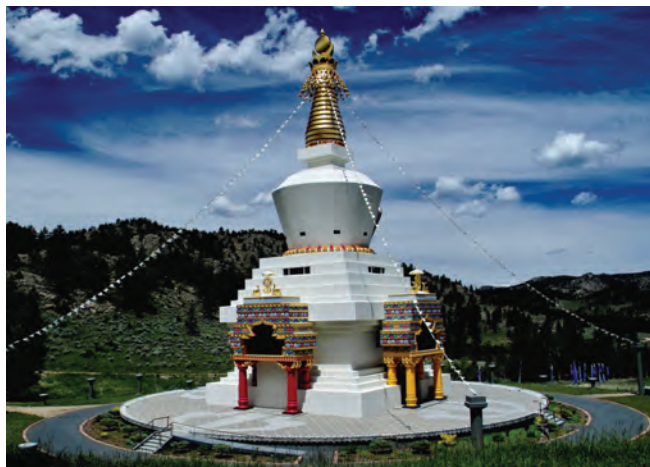
The Great Stupa of Dharmakaya stands 108 feet tall and crowns a meadow at the upper end of DMC's main valley.