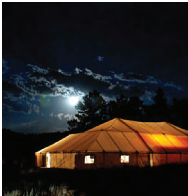
The summer shrine tent lit up at night.