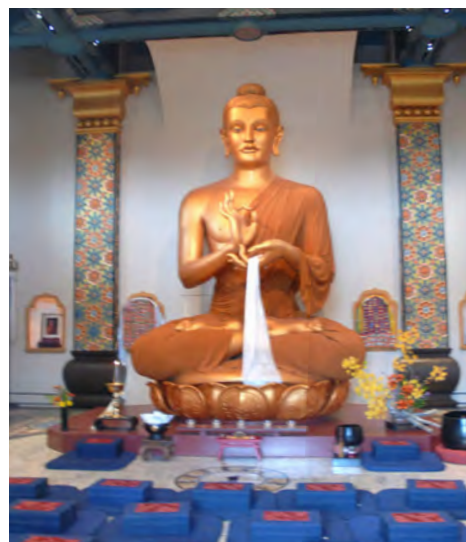
A 20-foot high golden Buddha, sculpted in the Gandharan style, sits inside the assembly hall of the Stupa.