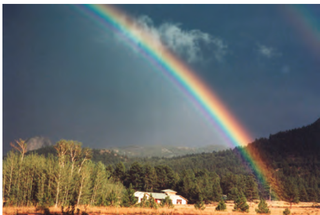
A rainbow glistens over the mountain meadows.