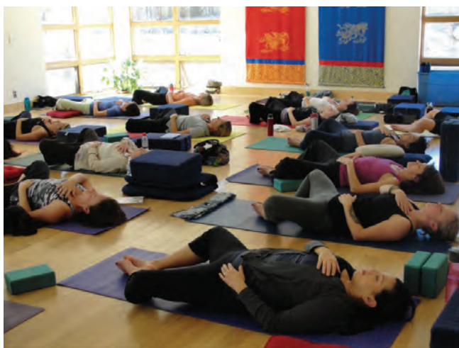
A yoga retreat in the Sacred Studies shrine room.